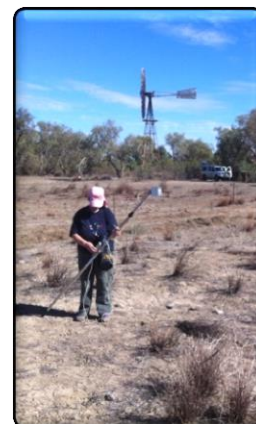
Figure 3 – In The Field